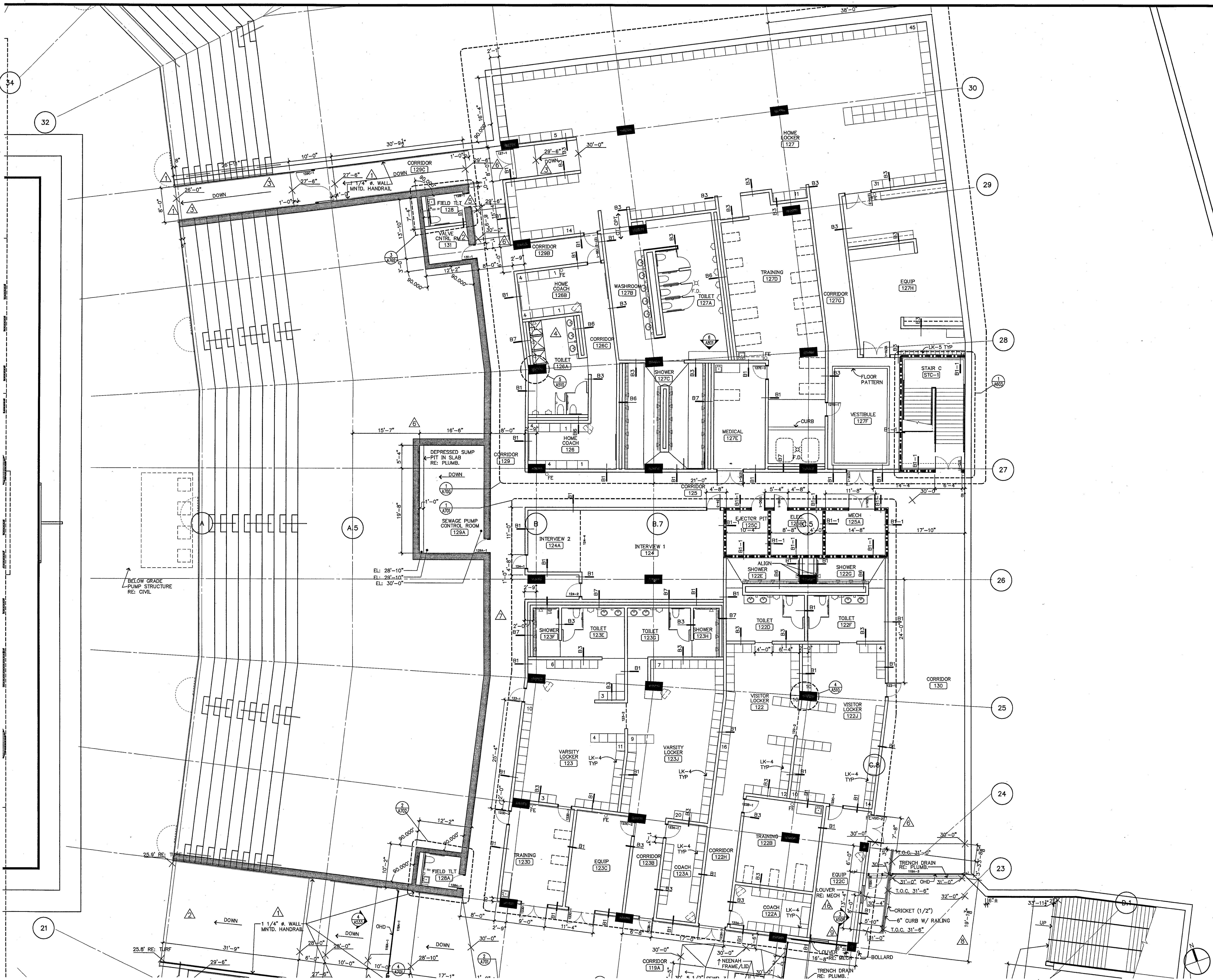
1 SERVICE LEVEL, AREA D - FLOOR PLAN 1/8"=1'-0" W:\DOCS\ARCH\MASTER\A101D\FWA.DWG 0 8 16 32 64 96